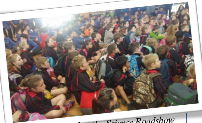
Fully focused at the Science Roadshow