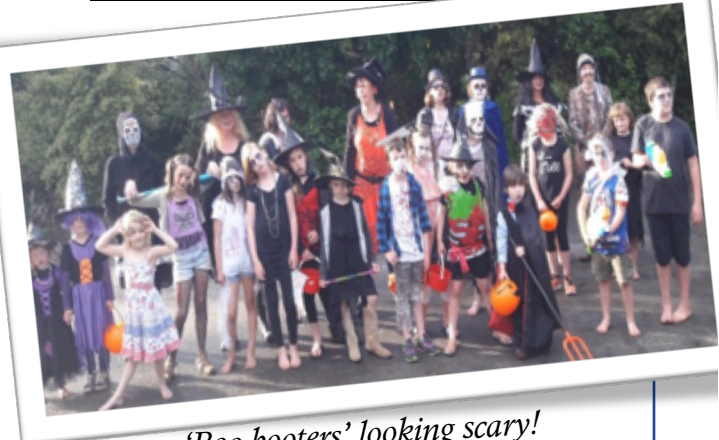
'Boo booters' looking scary!