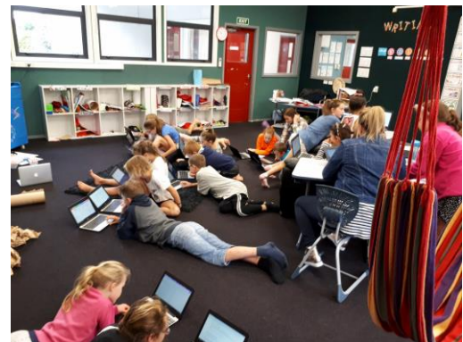
Maharahara working hard on their census